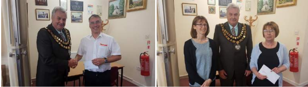
29 th Attended Health & Safety meeting followed by compound meeting

28 th June Severn side area committee meeting I am the Town Council representative followed by Full Town Council meeting. At this meeting we donated £5000 to the Caldicot Youth Service and £200 for the Libraries summer challenge.